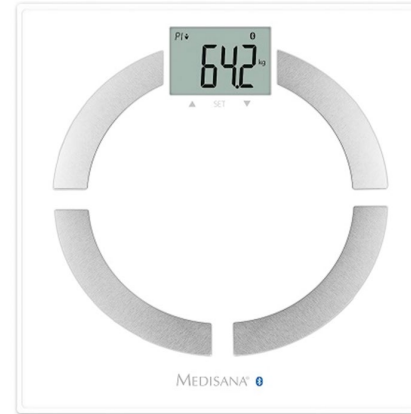
Diagnostic Weighing Scale