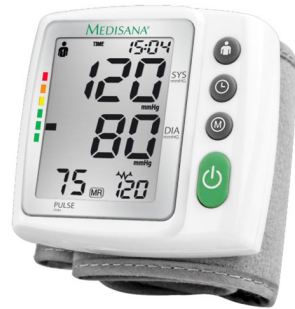
Wrist BP Monitor