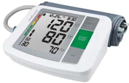
Upper Arm-BP Monitor